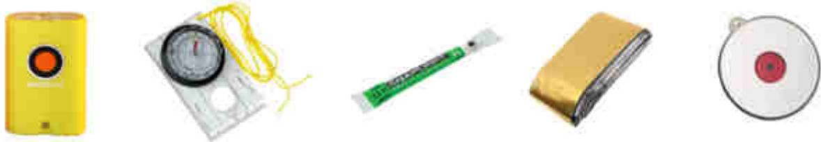
Strobe Flash Lamp – Compass – Light Stick – Alu Blanket – Distress Miroir

You have the possibility to buy safety equipment and to rent a sat phone on the MARLINK EVENTS e-shop.